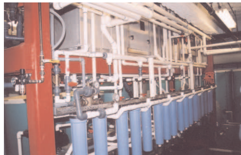
Plumbing and filtration