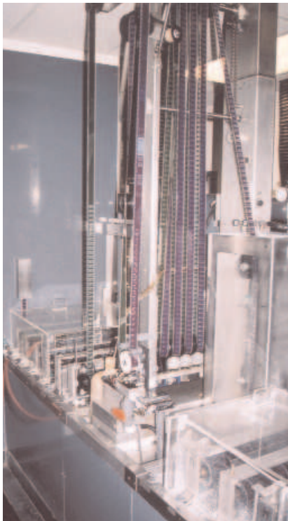
Wet Tanks with Elevator